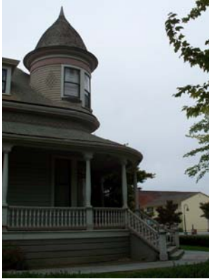
THE RDA OFFICE IS LOCATED IN THE HISTORIC PORTER HOUSE ON MONTEREY ST.